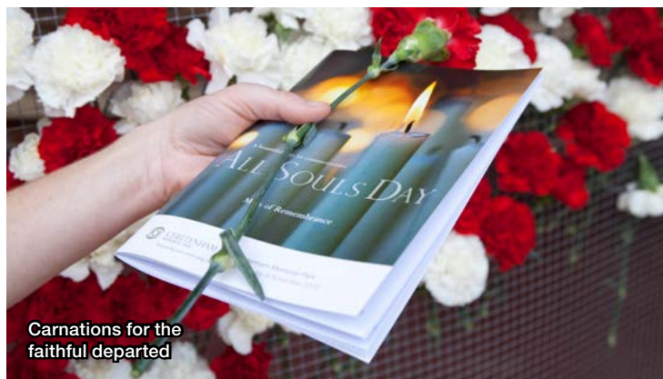
Carnations for the faithful departed