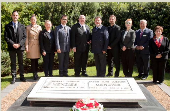
The delegation from the Hungarian Embassy with SMCT representatives at the grave of Sir Robert Menzies.

It was fitting that such an auspicious occasion, acknowledging the struggles, triumphs and prosperity of the people of Hungary, was held within the beautiful Prime Minister's Garden at MGC.