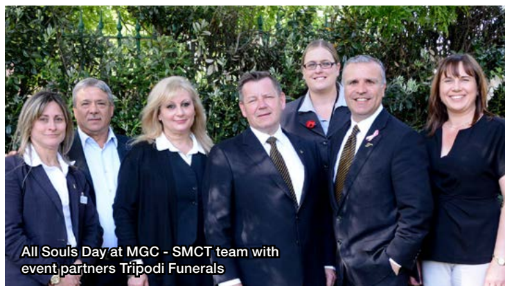
All Souls Day at MGC - SMCT team with event partners Tripodi Funerals