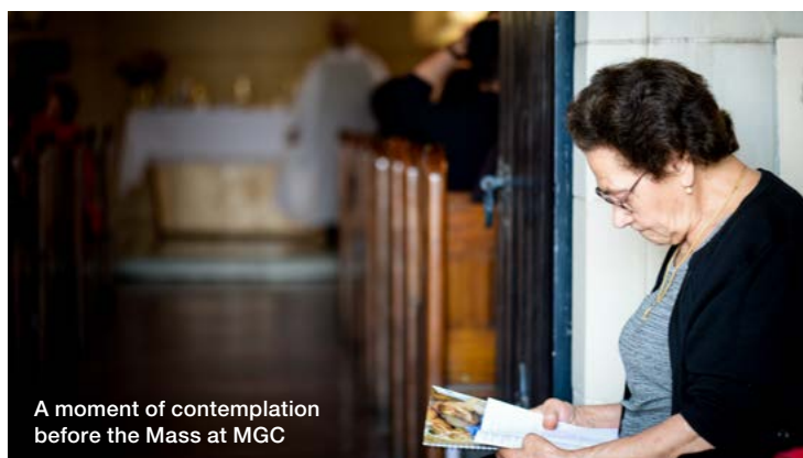
A moment of contemplation before the Mass at MGC