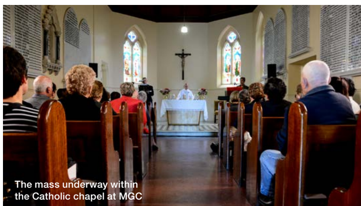
The mass underway within the Catholic chapel at MGC