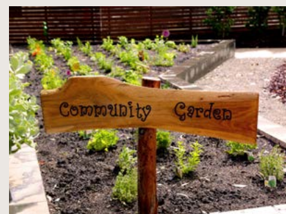
The Community Garden taking shape at Springvale Botanical Cemetery